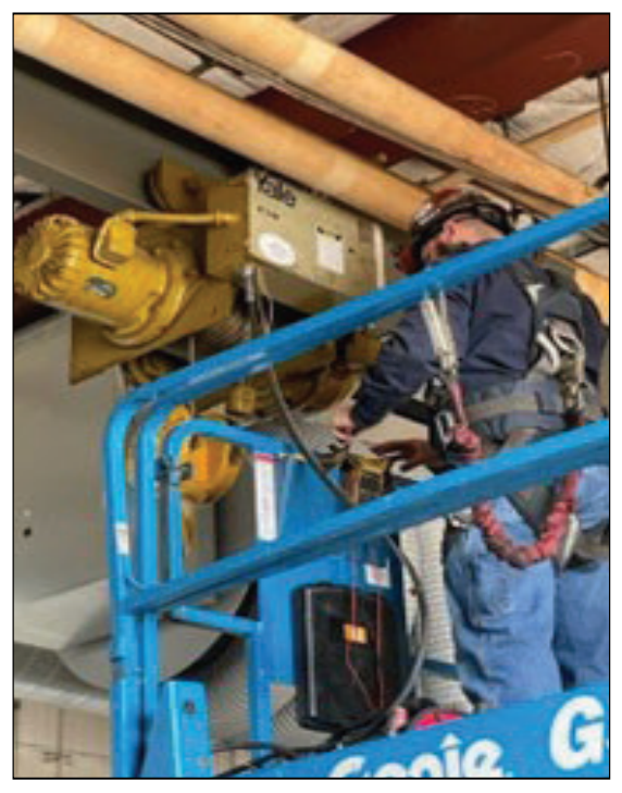
Technicians perform inspection at a Vehicle Maintenance Facility for the Army Reserve's 88th Readiness Division.