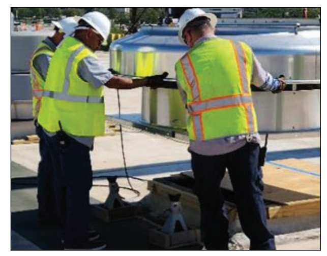
Technicians Install new Central Utility Plan Exhaust Fans at the Military and Family Support Center, Fort Cavazos, Texas.

Performing routine preventative and on-demand corrective maintenance increases the facility operability rate and decreases the amount of time and money associated with extensive repairs.